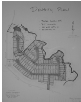
Normal typical and traditional subdivision plan