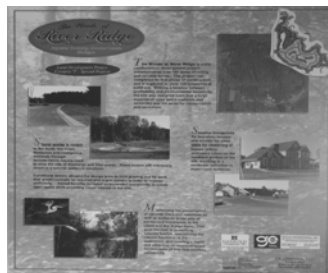
A presentation board for ACEC design award competition